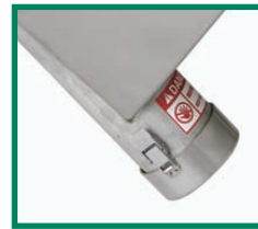
Snap on end cap